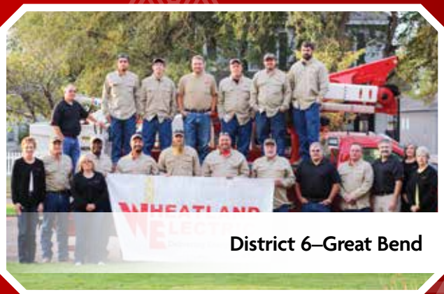
District 6—Great Bend