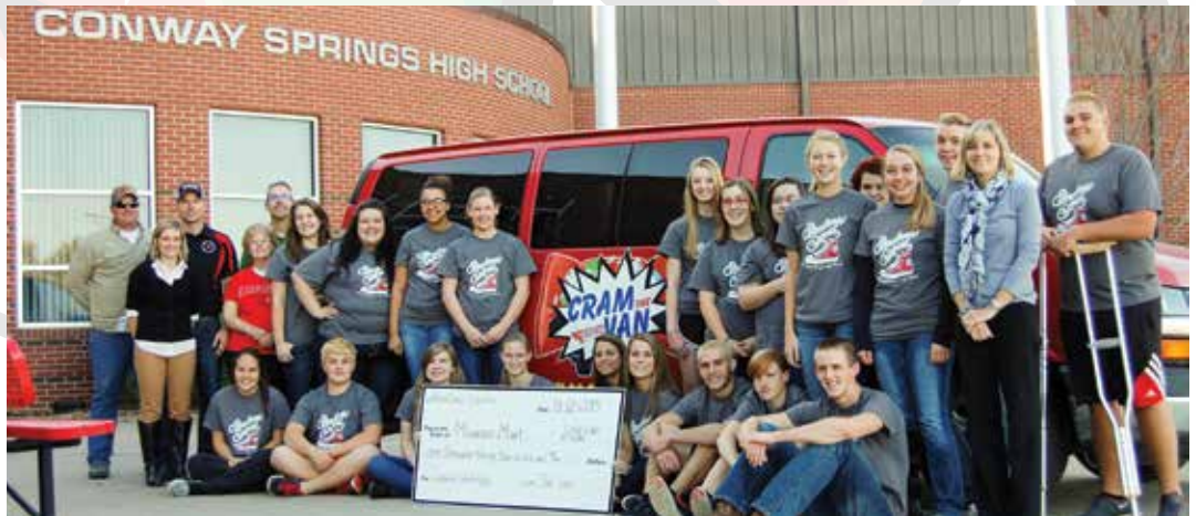
Wheatland and Conway Springs High School teamed up to collect 820 lbs. of food and $1,032.80 for their local food bank.

“Cram the Van” lasted two months and featured 11 stops in 10 different communities throughout