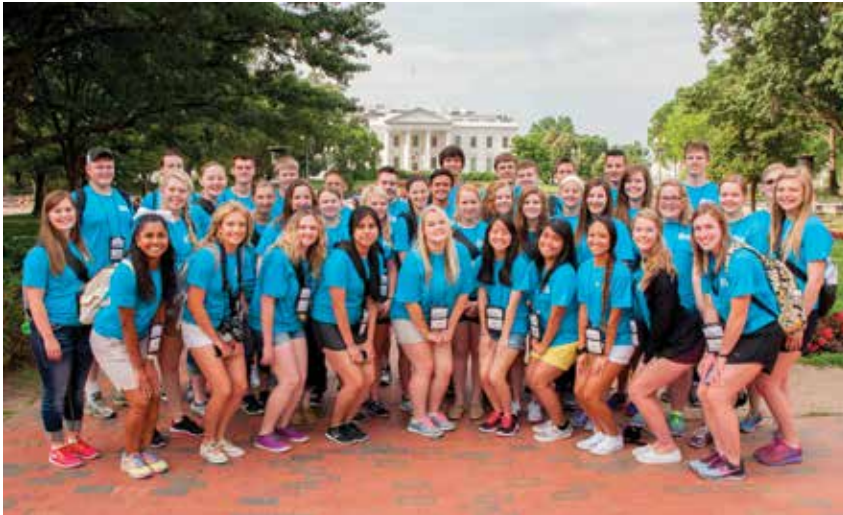
Each year, students from Kansas join more than 1,700 youth in Washington, D.C., to attend the Electric Cooperative Youth Tour. Next year's Youth Tour is scheduled for June 9-16.