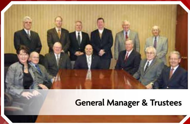
General Manager & Trustees