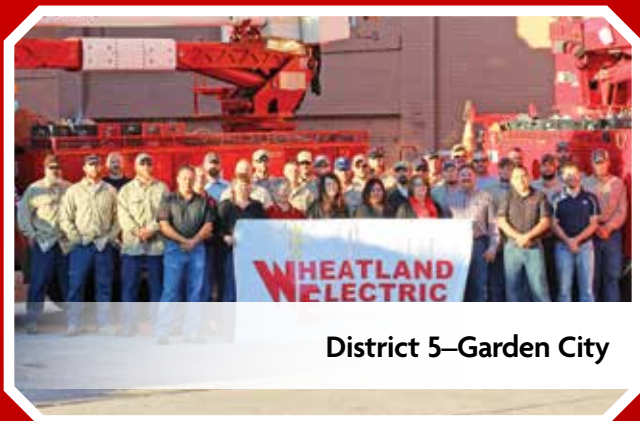
District 5—Garden City