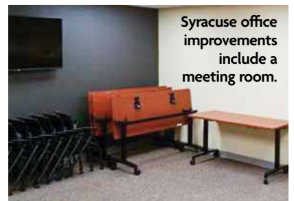
Syracuse office improvements include a meeting room.

As well as the two consumer service representative work stations, an updated kitchen, ADA compliant bathroom facilities and a new meeting room were part of the remodel. The outside was even updated with a little stucco, awning and new sign.