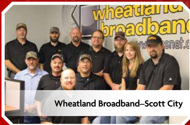
Wheatland Broadband—Scott City

WANTING TO BRING YOU AND YOUR LOVED ONES