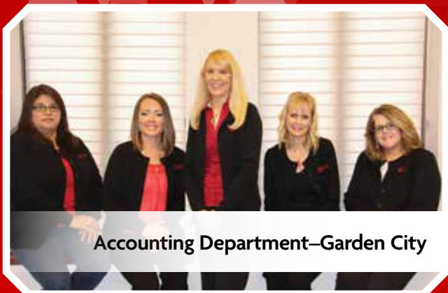
Accounting Department—Garden City