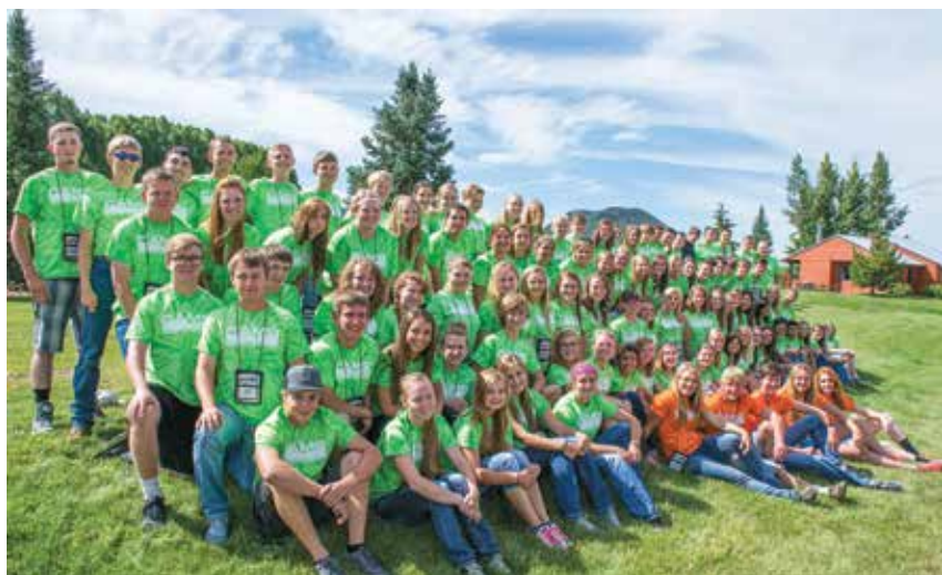
Kansas delegates attend Cooperative Youth Leadership Camp along with students from three other states to develop leadership skills and learn about cooperatives. The 2016 camp will be July 16-22.