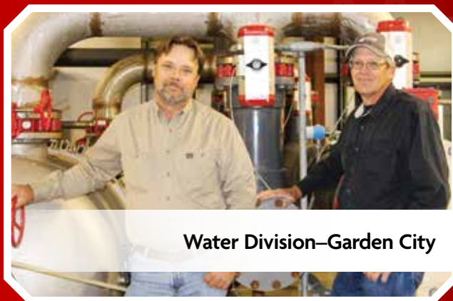
Water Division—Garden City