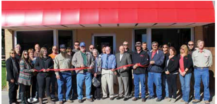
Wheatland employees were on hand for the official re-opening of the remodeled Syracuse office in October.

Wheatland recently re-opened the Syracuse business office after an extensive remodel. Since July, the business office has been operating out of a temporary trailer at the warehouse facility on S. Barber St. while the office on Main Street was completely gutted and redone.