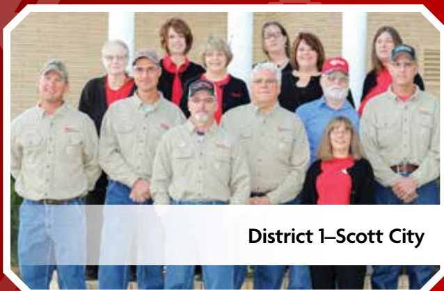
District 1—Scott City