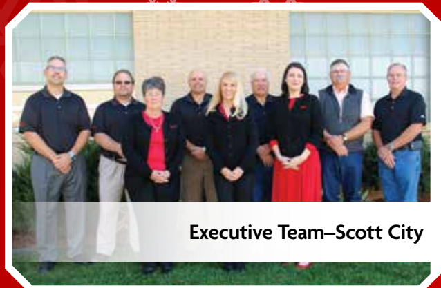
Executive Team—Scott City